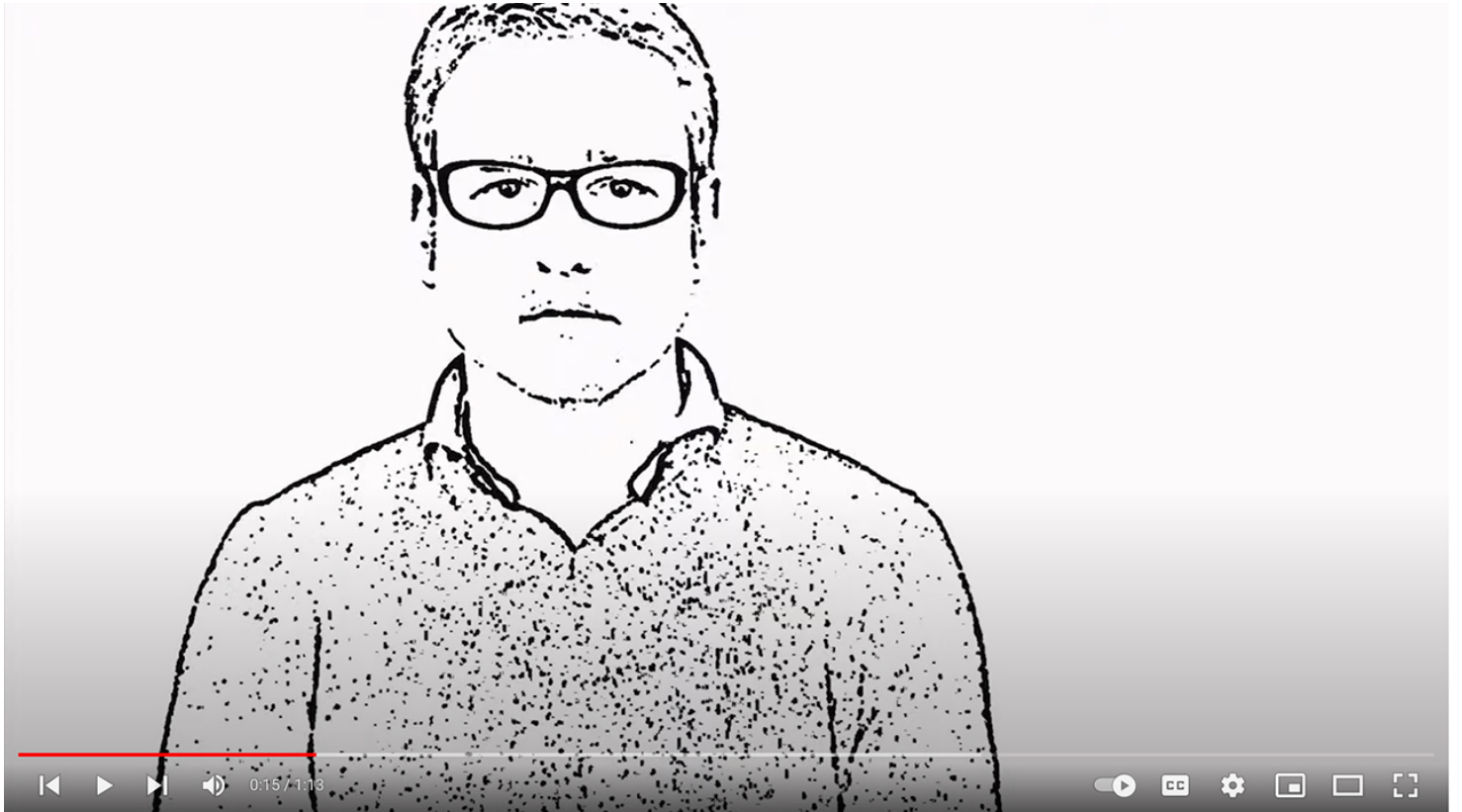
breeze and pearls exhibition trailer