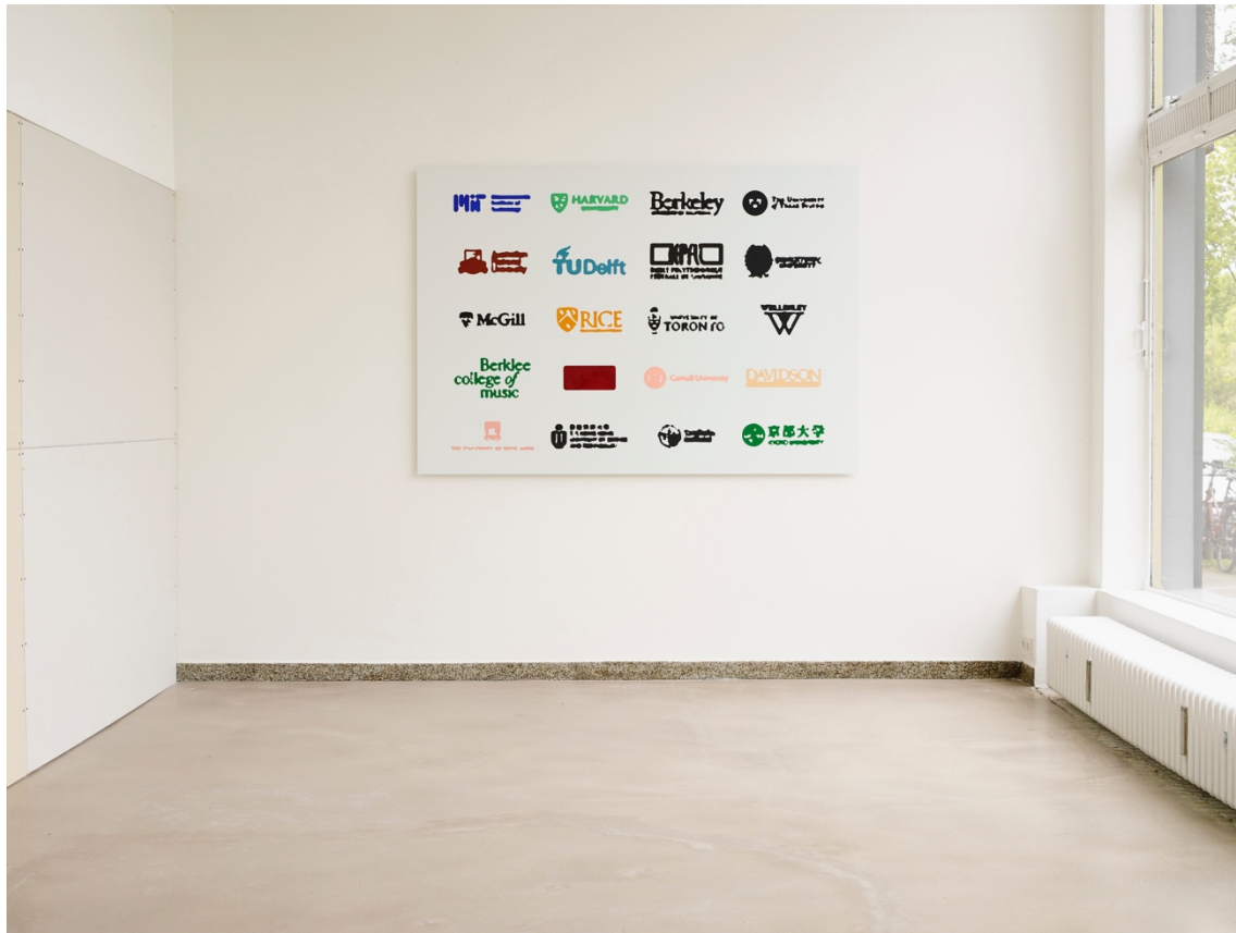
boaz kaizman O.T., 2014 168 x 146 cm acryl on alubond