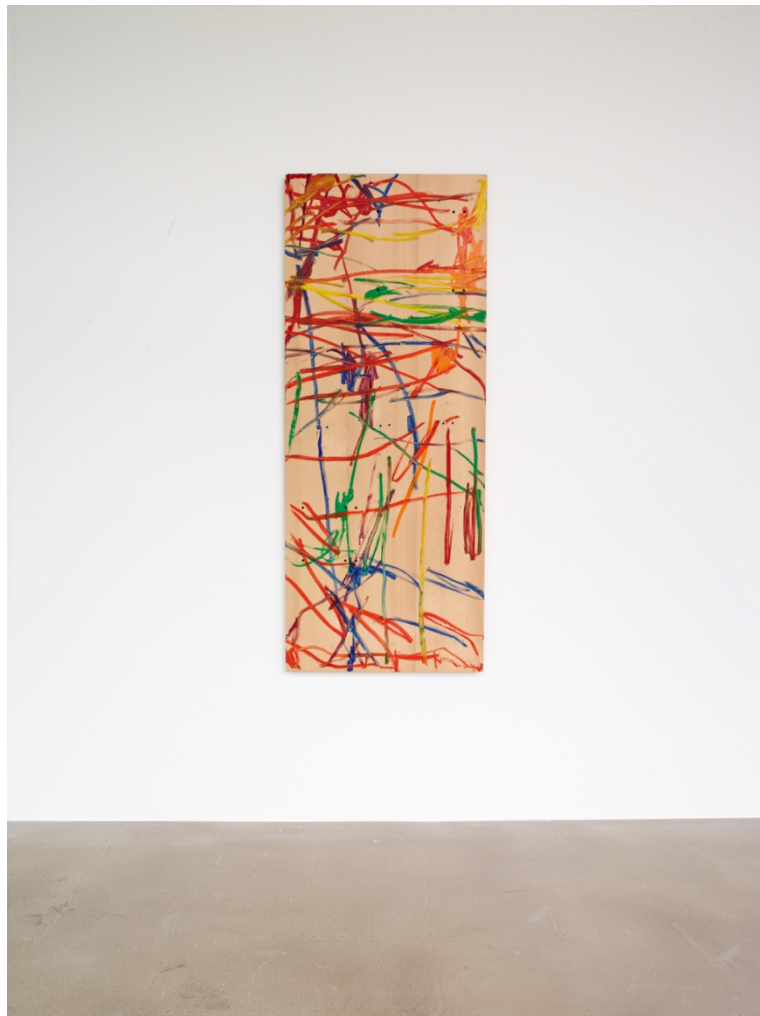
boaz kaizman O.T., 2014 168 x 60 cm oil pencils on wood