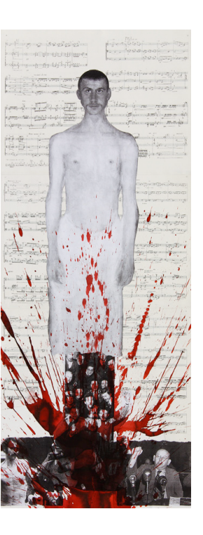
marcel odenbach Verklärte Welten, 2012/13 collage, photocopies, transparent paper, aquarell, colored pencils and ink on paper 89,3 x 36 cm (parts 1 & 3 each) 36 x 96 cm (part 2)